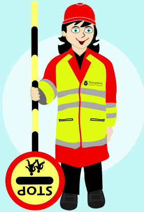
Figure A - Sign upside down Not ready to cross pedestrians