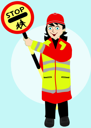
Figure C - Sign held up high Ready to cross pedestrians - vehicles must be prepared to stop