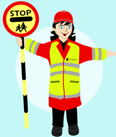
Figure D - Extended out All vehicles must stop