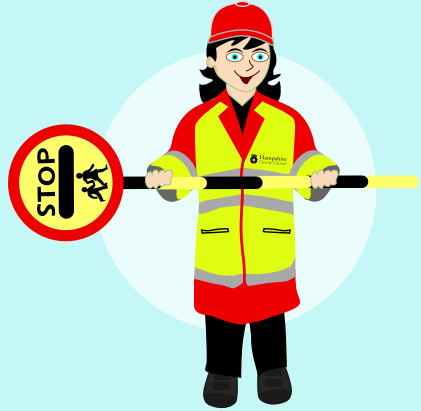
Figure B - Sign sideways Barrier to stop pedestrians crossing