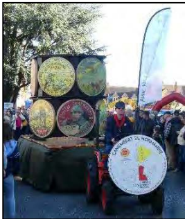
Apple Fair, 2018 – showing Camembert de Normandie!

The annual Apple Fair (Foire de la Pomme) in Vimoutiers was cancelled this year for the first time since its inception over 70 years ago due to public health concerns. This wonderful event is an opportunity for the town of Vimoutiers and its surrounding area to show off its produce and hold a lively, colourful carnival in which everyone is involved. The Apple Fair is also the annual meeting of Vimoutiers' twin towns from Belgium, Germany and of course, from the UK.