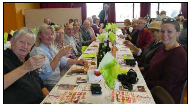
Apple Fair – Party time!

In 2021, Fordingbridge and Vimoutiers will celebrate their 40 th anniversary of twinning, and Sontra will celebrate its 50 th anniversary of twinning with Vimoutiers. We are all hoping that these two celebrations will be able to be held in Vimoutiers next summer – we will be in need of a party!